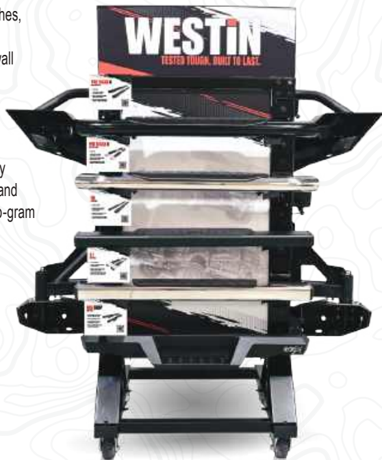
STEP UP PRODUCTS Example Shown