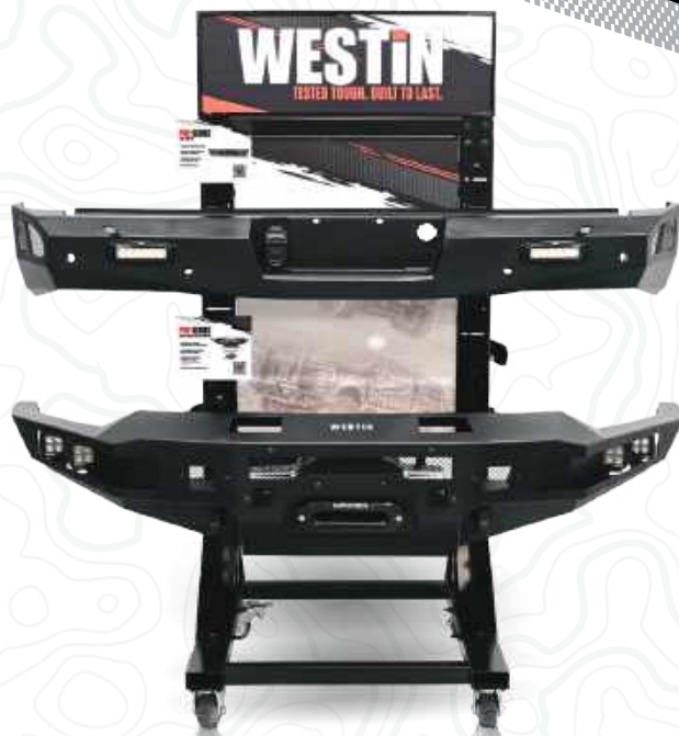
BUMPERS Example Shown